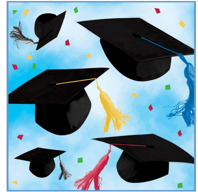
Hats off to our seniors finishing in January!

who will be leaving Clark this January. Last year 18 seniors finished in January. Some of the students say that the school will feel different when these 12 seniors leave, but it will also allow teachers and students to have more time working one on one together as some classes will have fewer students. These seniors are applying for jobs, planning to go to college, or hopefully, entering nursing and cosmetology programs as they plan for their futures. Clark wishes these seniors the best of luck in their life after graduation and hope that they are very successful. We also hope these seniors know they will be missed here. This school year, the graduation ceremony will be on May 31st. Hopefully, we will see our January graduates return for that event so they can let us know how they are doing.