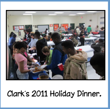
Clark’s 2011 Holiday Dinner.

A study done by Teens Health Magazine in 2010 shows that in today’s society there has been a steady rise in the number of students getting involved in extracurricular activities. In these activities, students are able to explore their physical, creative, social, and career interests with like-minded people.