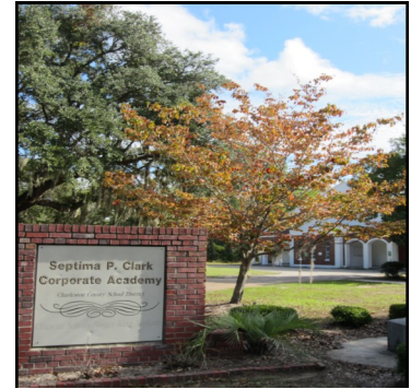
It's a beautiful day at Clark Academy.